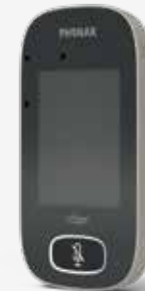
Roger Touchscreen Mic